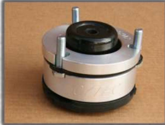
3" lift shown in pictures