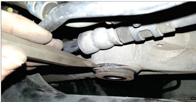
Passenger side: The rack will move toward the passenger side and forward just enough to remove the bushing. Use a Tie-Down strap to hold rack in place while removing bushing.