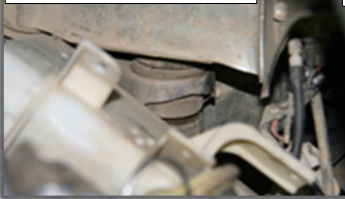
FRONT PASSENGER BODY MOUNT