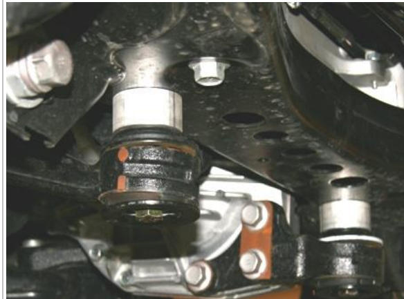
Diff Drop kit Installed (Fig. 2)